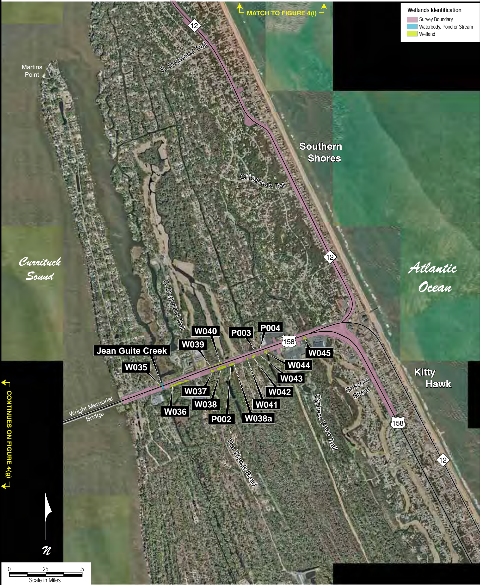
Jurisdictional Features Map