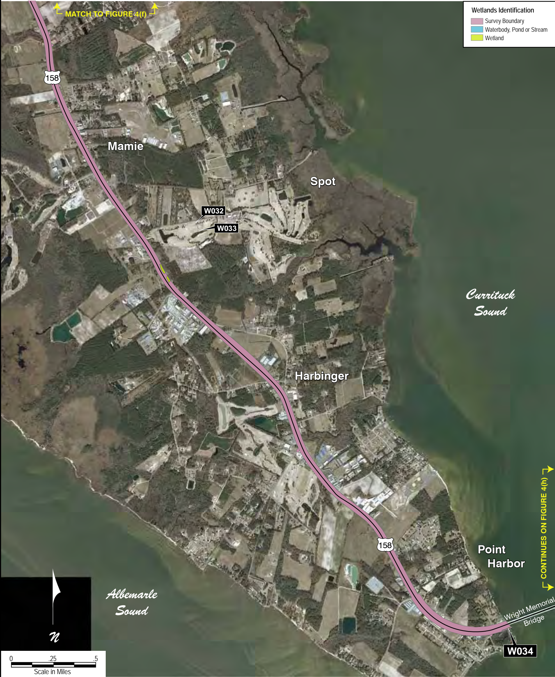
Jurisdictional Features Map