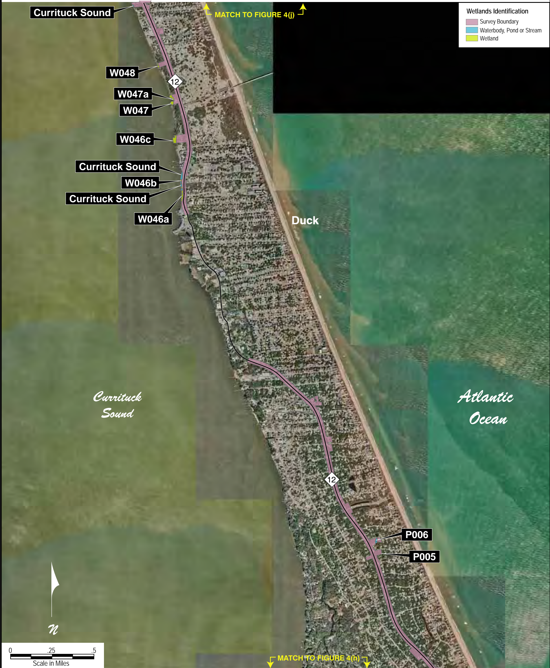
Jurisdictional Features Map